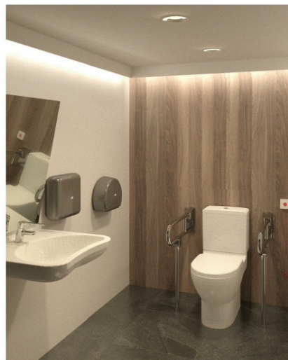
3 Aseo PMR - render 3 2.2